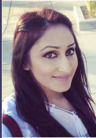
Nazia Hasan Bell Policy Center